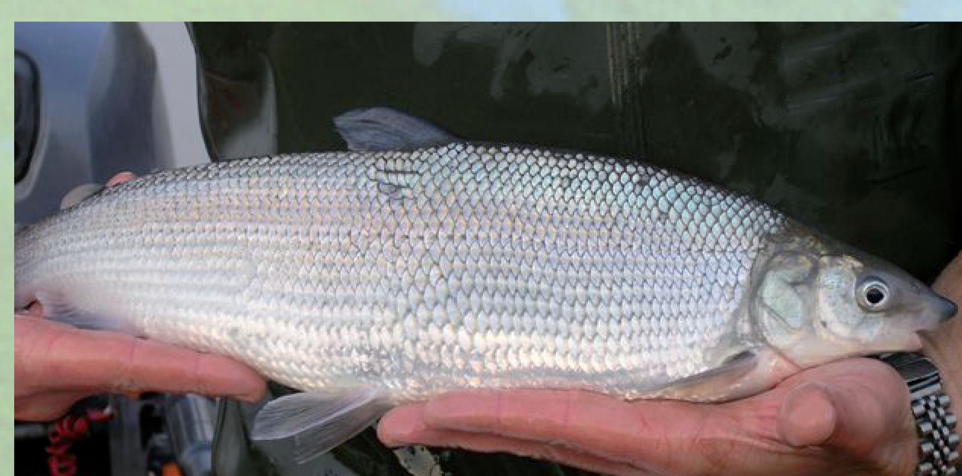
The houting may reach 60 cm and more than 10 years of age

The houting has a natural leading part in the Houting-project... But many other animal and plant species will gain as the houting's habitats and survival are ensured – species as e.g. salmon, lampreys and otter – and maybe even the white stork.