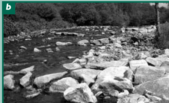
Figure 1: River Neb with (a) dilapidated weir (summer 2006), and (b) the rock ramp (spring 2007) which has replaced it