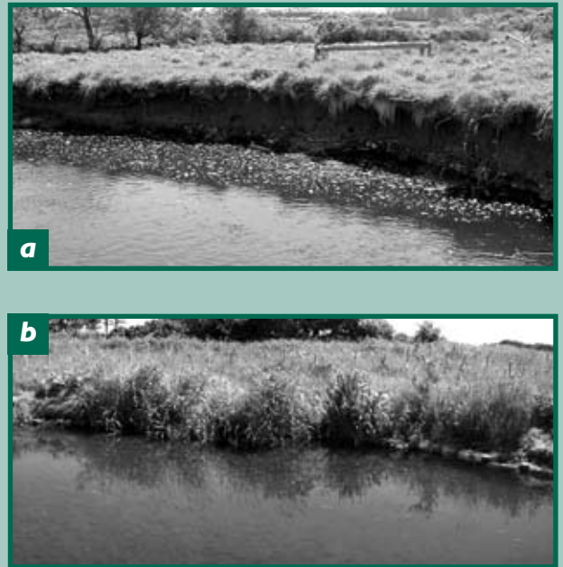
Figure 2: Bend on the Silver Burn in (a) August 2006, showing cantilever erosion, and (b) June 2009, three years after 'green' engineering

failed in the past leaving potential for the river to divert from the weir, an undesirable prospect in this instance. The work was used as a training exercise in soft engineering for the DoT's works gangs with Salix River & Wetland Services Ltd contracted to supply the design and supervision. Faggots topped with coir roll were used to construct the desired course and, after regrading and seeding, the bank was reinforced with NAG350 geotextile. In order that only plants of native Manx provenance were used, the coir roll was installed bare and later planted with marginals. A small backwater was also created at the site and a copse of native trees planted to further enhance the area's wildlife potential. The project has led to other green initiatives such as the creation of a lagoon for supplying pre-planted coir roll and the sourcing of faggots from the Manx Wildlife Trust using willow cut during coppice management of nature reserves.