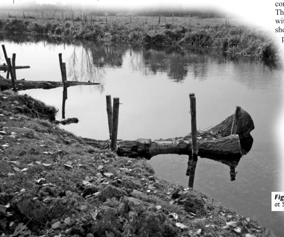
Figure 1. Wood deflectors installed at Seven Hatches

The as-built and post assessment provided an inventory of the restoration techniques used and detailed several key aspects of the scheme (visual and social elements; physical characteristics; vegetation; fish and aquatic invertebrates; mammals;